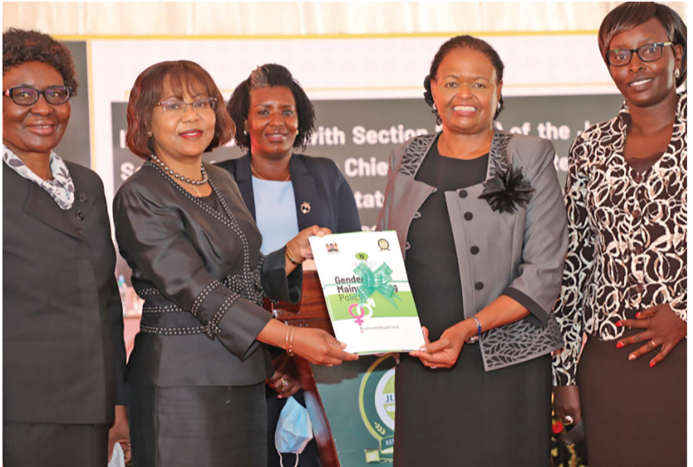
Launch of the Gender Mainstreaming Policy